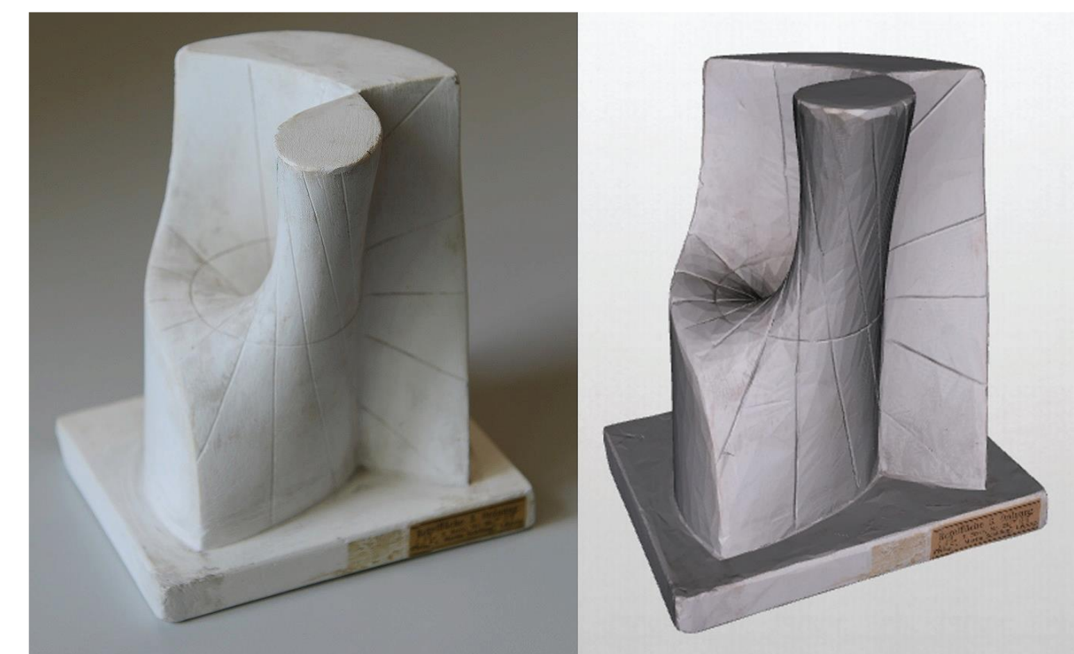
Ruled surface of third order (Catalogue Schilling, VII 20) Left: Photograph of the historical model Right: Rendering of the digitized model inside of the Mediabox