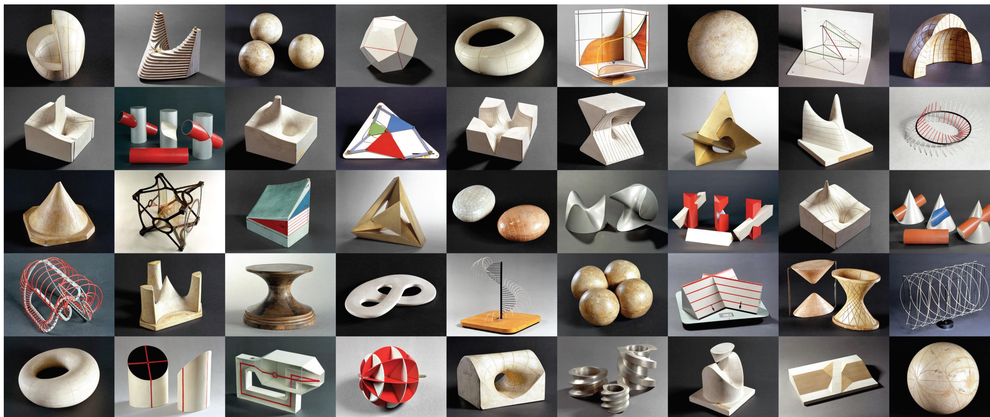
Selection of mathematical models from the collection at the TU Dresden.